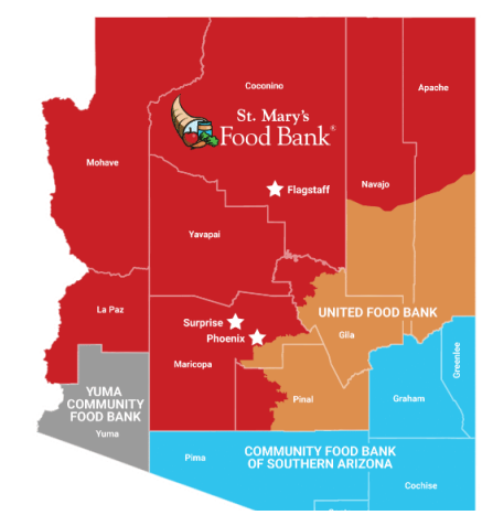
Figure 1. St. Mary's Food Bank Distribution Area.

Even before the pressures created by the COVID-19 pandemic, suggesting and recommending healthy recipes to local distribution agencies and recipients was an on-