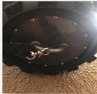
Figure 1: A steel rod attached to a plate attached to a plastic tire