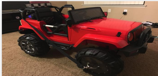
Figure 3: The final design