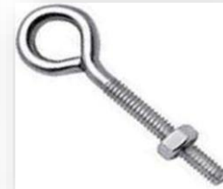
Figure 4: Eye bolt