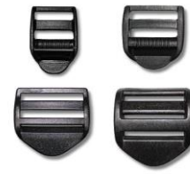
Figure 5: Strap adjuster