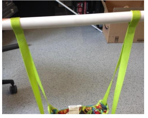
Figure 13. Harness to PVC Connection

3. Run adjustable tow strap through the PVC section and rock climbing swivel and adjust to desired height ( Figure 14 )