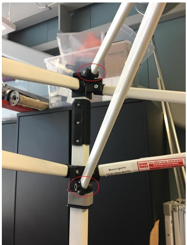
Figure 1. Top Bolt Removal