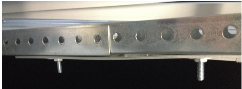
Figure 5. Reinforced Guide Rail