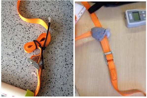
Figure 15. Safety Precautions for Adjustable Tow Strap

material to prevent child from injuring themselves (Figure 15).