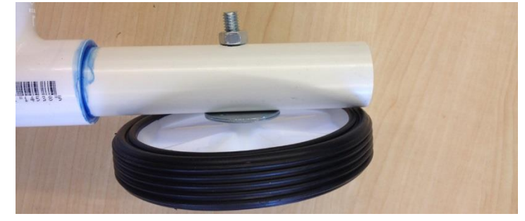
Figure 10. Wheel Washer Placement