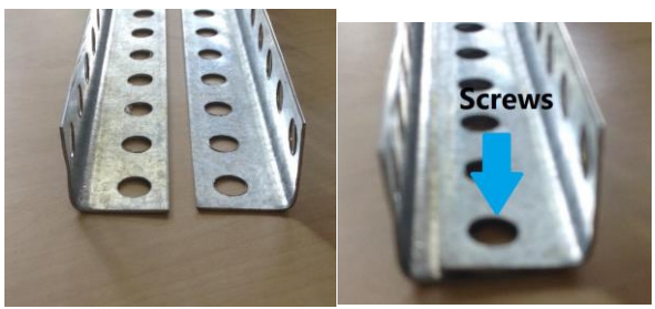
Figure 4. U-Shape Track Construction