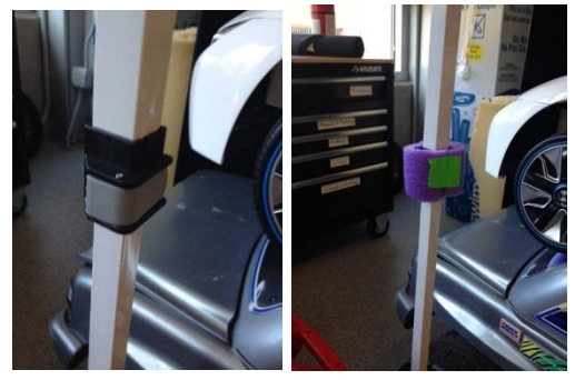
Figure 3. Sharp Corner on Easy Up Safety Precaution

CAUTION: The legs of the Easy Up may contain sharp edges and need to be covered to avoid user injury. We used sections of pool noodle to cover our sharp corners, but Easy Up design may vary (Figure 3).