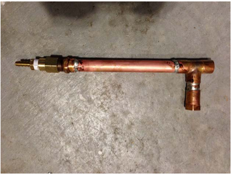
Figure 2.3.1- Inlet/Astrometric hut tee fitting.

This piece, as well as the tee for the gate valves and the tube-NPT adapter for the imaging station was successfully soldered in place the week of March 3. Currently, the supply line is completed with the exception of the coil, tanks, and rigid mounting brackets.