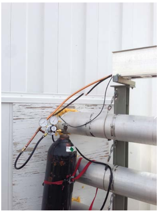
Figure 2.2.1- Nitrogen tank installed near astrometric hut.