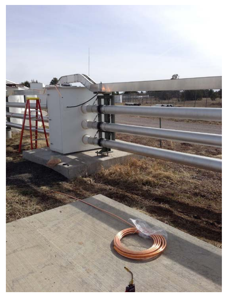
Figure 3.3.1- Coil location relative to gate valves and cable tray.