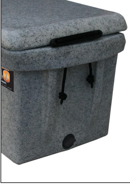
Figure 1 – side view of existing 40 qt.

Through conversations with the companies CEO it was determined that the smaller spectrum of coolers is the highest selling unit the company offers. These coolers range from 22 to 40 quart sizes. One in particular, the 40 qt. cooler, is in high demand. However, this particular product lacks in the quality and usability that Canyon Coolers wants out of its flagship product. One if its primary defects lie in its incompatibility with common uses. The design features ribs that join the cooler body to the lower lip that forms the shelf for the seal. This creates an obstruction for users that want to fasten the cooler in place utilizing the sides. The ribs on the existing 40 qt. can be seen in figure 1 below.